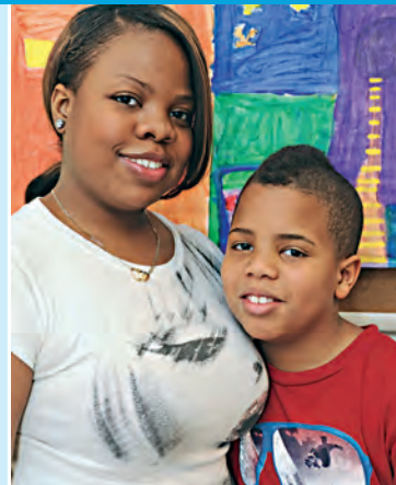
Family Rewards participant and son