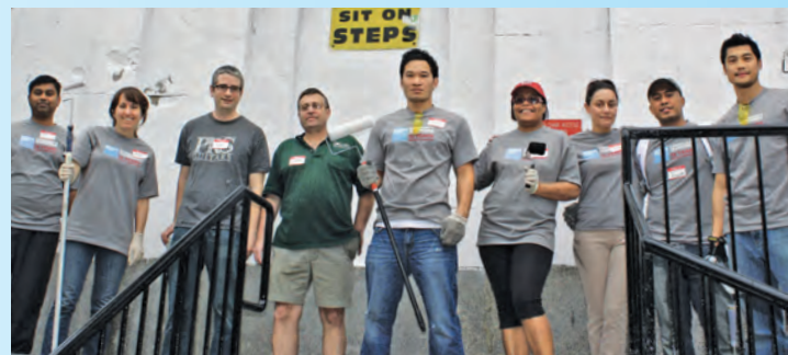
Goldman Sachs volunteers with BronxWorks staff